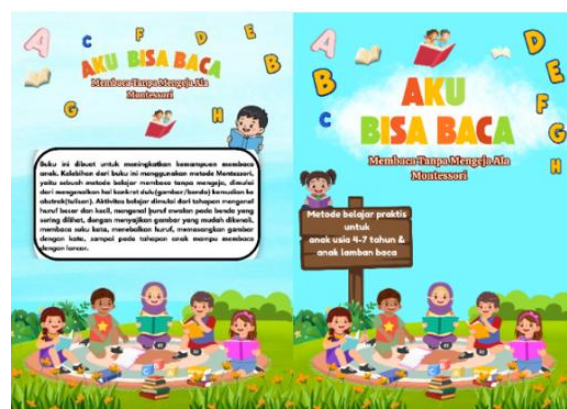
Image 2. BASIBA cover design