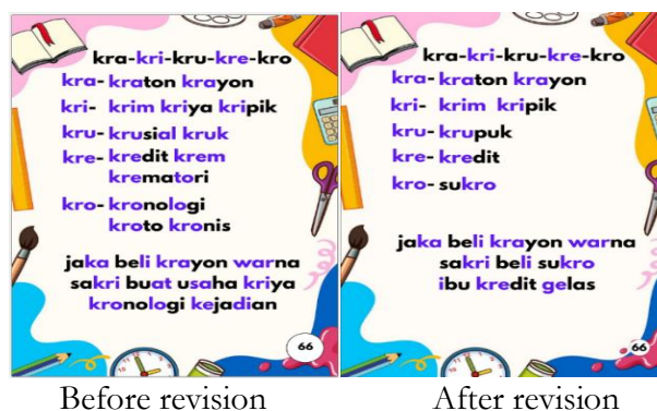
Image 4. Revision by subject matter experts