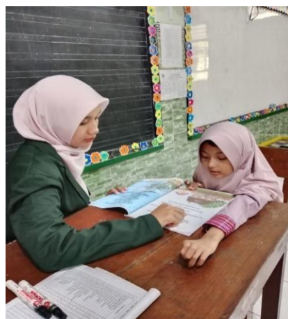
Image 6. Students reading BASIBA

Based on the data analysis in the table above, a picture of student learning outcomes was obtained before and after the implementation of BASIBA. The average ( mean ) value of the sample (N=30) experienced an elevation from 63.43 ( pre-test ) to 80.63 ( post-test ), reflecting a difference in improvement of 17.20 points. The decrease in the standard deviation from 9.235 to 4.453 confirmed the homogeneity of the distribution of student abilities after the intervention. This descriptive finding indicates that the developed product initially had a positive impact on students' initial reading skills. Statistical validation of the significance of the increase in initial reading skills.