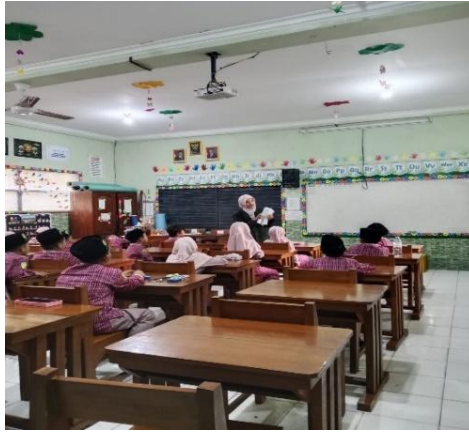
Image 5. BASIBA Demonstration