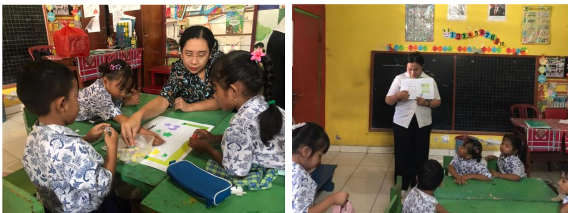
Image 2. Implementation of the Study in the Control and Experimental Classes

After the entire sequence of learning activities was implemented in accordance with the research design (as illustrated in image 2), the scientific literacy skills of early childhood learners in both groups were assessed using a predetermined and previously validated instrument. This assessment was conducted at the end of the intervention phase to capture children's learning outcomes as a cumulative result of the instructional processes they experienced. The collected data were then analyzed sequentially and systematically. Descriptive analysis was first employed to provide an overview of the data characteristics, including mean scores, score distributions, and patterns of scientific literacy development within each group. Subsequently, prerequisite tests were conducted to ensure that the assumptions required for further statistical analysis, such as normality and homogeneity of variance, were adequately met. Finally, inferential statistical analysis was applied to empirically examine the effect of the treatment on children's scientific literacy skills, thereby determining whether the observed differences between groups reflected a genuine instructional effect rather than random variation.